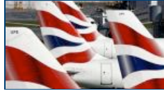
Airlines rein in hedging despite oil price crash