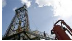
How low can oil go? A lot lower, but it'll recover